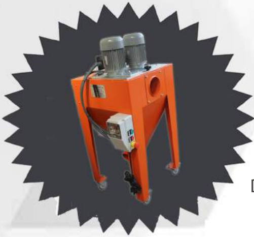
Dimensions of machine